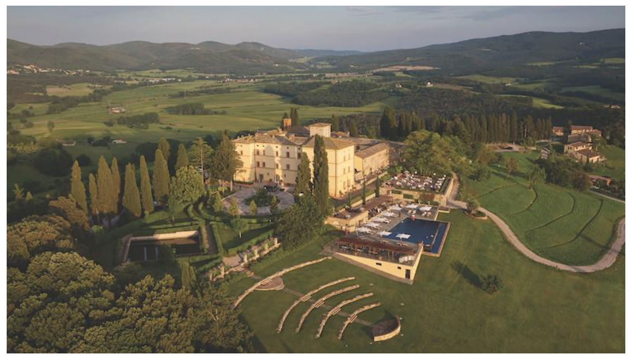
Castello di Casole in Tuscany, Italy offers a rural escape with contemporary luxury

Evoke all your senses in some of Europe's most inspiring and enriching destinations, with these bespoke experiences: