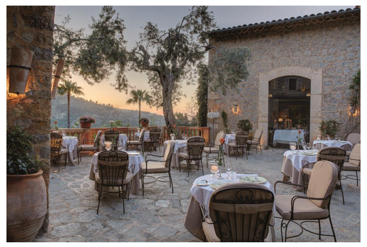
Belmond La Residencia, Mallorca is an art-filled oasis